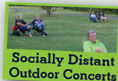
Socially Distant Outdoor Concerts