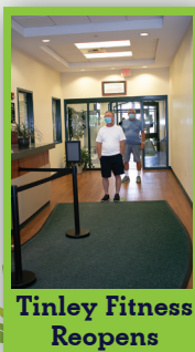
Tinley Fitness Reopens

We temporarily deferred payment for summer 2020 programs until it was certain the programs would run.