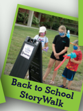
Back to School StoryWalk