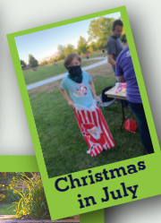
Christmas in July