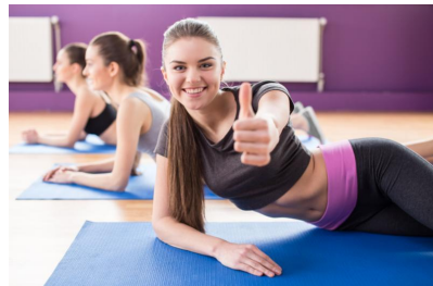
Group Fitness September Schedule