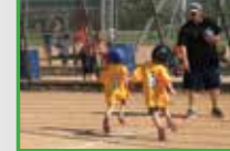
Athletic Programs, Leagues and Events