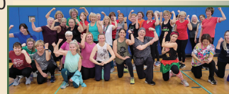
2022 Charity Zumbathon

The facility offers state of the art equipment including 16 new weight machines, two new assault runner treadmills and two new expresso interactive bikes. 2022 served 30,000 participants in group and aquatic fitness classes. Our 4,609 members made over 180,000 visits to Tinley Fitness to enjoy the benefits of classes, cardio and weight machines, personal training and the 4-lane pool.